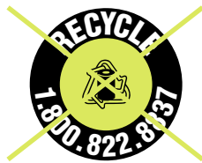
Figure F: Seal must be used with RBRC name and chemistry.